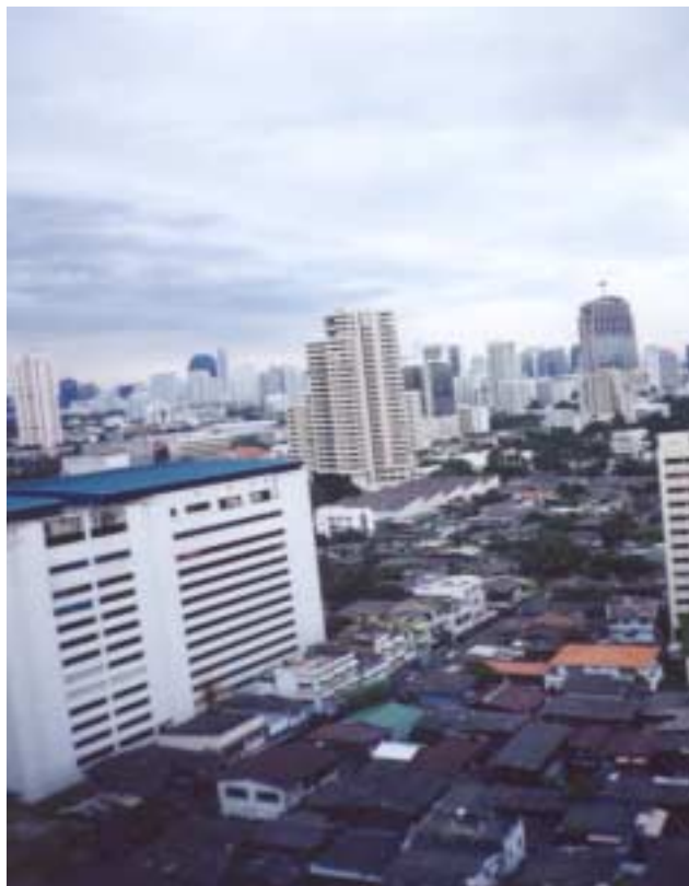
Picture 5. 1. View of Bangkok.

Bangkok lies in the humid tropics and lasts hot throughout the year. There are three main seasons in the region: the cool season (November to February), the hot season (April to May), and the rainy season (June to October). These seasons are depending on the monsoon rains in any given year and they have a strong effect on habitant's lives. The average annual rainfall in Bangkok region is 1,482 millimeters (Thailand in a Nutshell 2001, Thadanithi 1998).