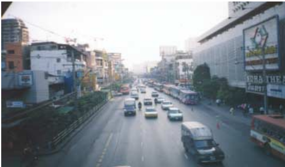
Picture 5. 2. The Bangkok traffic in daytime, when the congestion is lowest.

About 80 per cent of the air pollution from the traffic is coming from the public transportation, mostly busses. The use of public transportation is enormous more than 5 million trips are made by public transport daily. Most of the busses are in very bad condition and pollution is visible. Private cars are mostly new and in good shape because they are very expensive and only rich people can afford them. Long-Tail boats, which work as ferries in the Klongs, are also in bad shape and their engines are highly polluting (Laaksonen 2001, UN 1995).